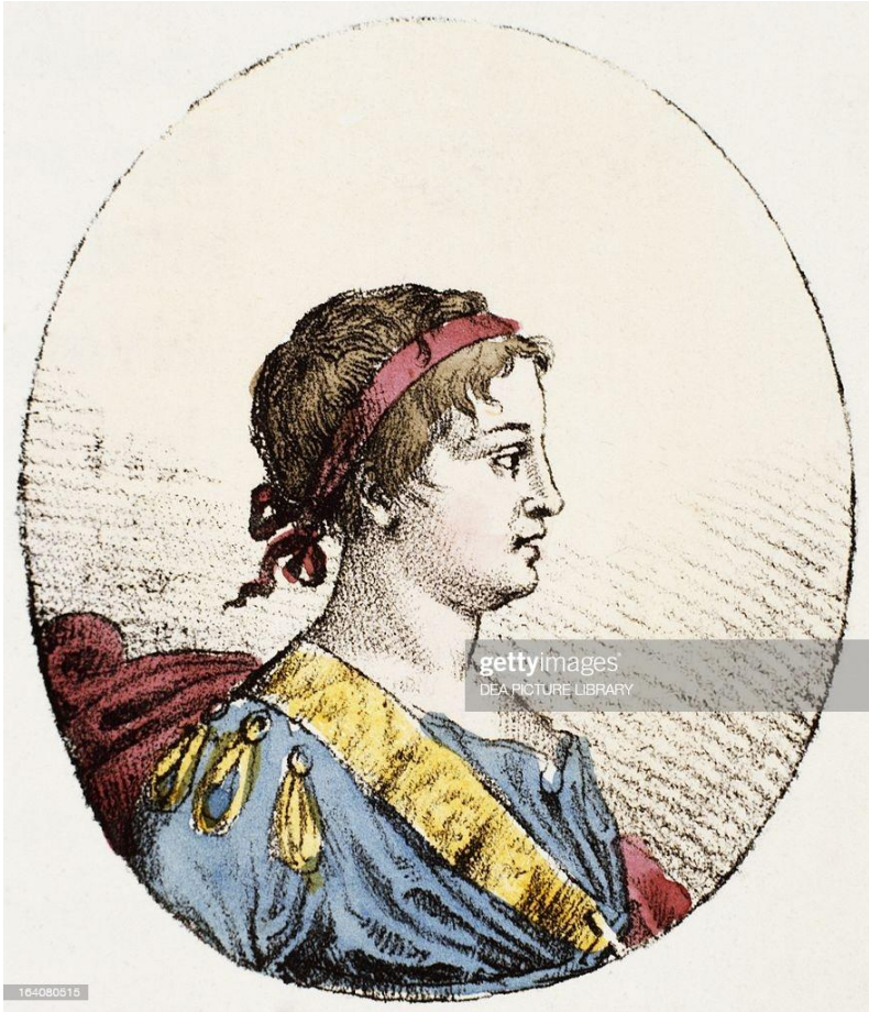
Portrait of Ivan VI Romanov (St Petersburg, 1740 - Slisselburg, 1764), Tsar of Russia, engraving. Russia, 18th century.