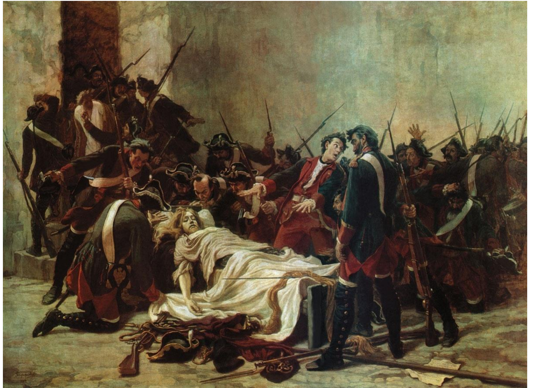
Painting: Mirovich Standing over the Corpse of Ivan VI (1884) by Ivan Tvorozhnikov